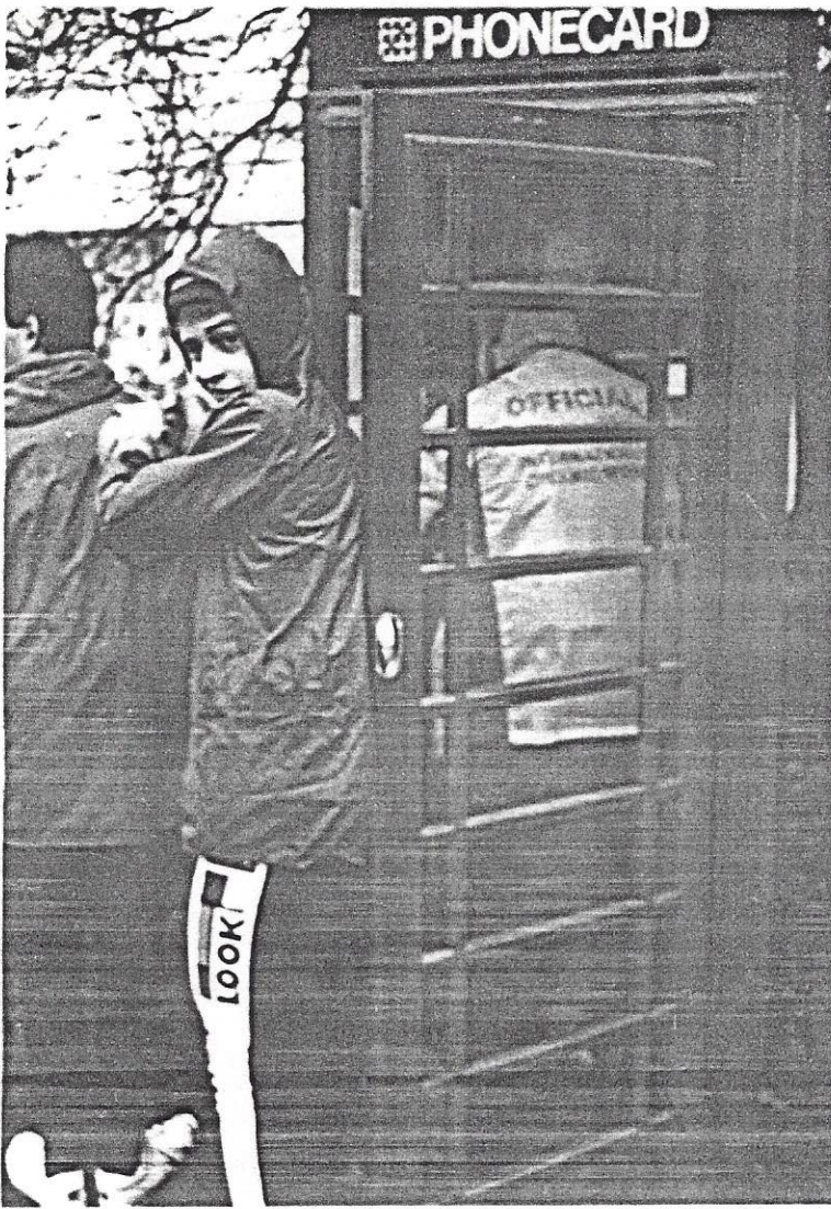
Left - Clocking on at the East Hoathly "Tardis".