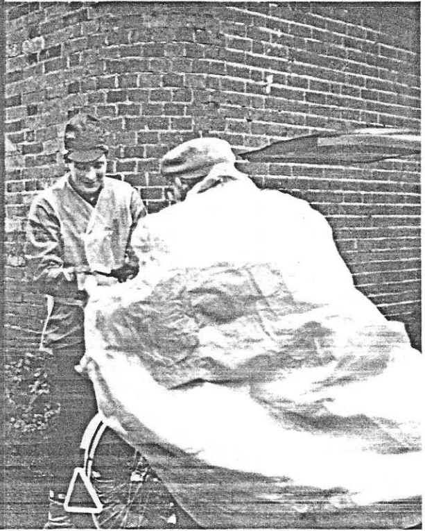
Below - President Lock in a determined mood.